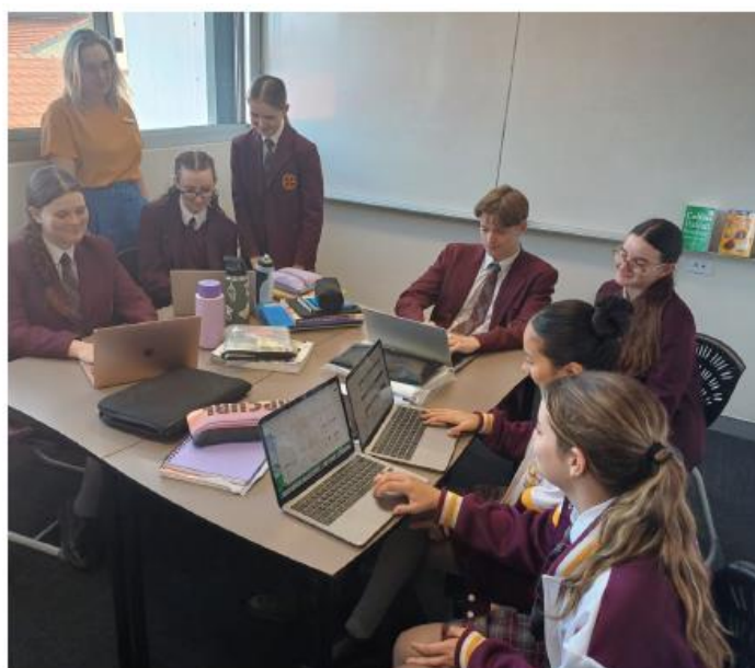
Mandurah Catholic College ViSN students